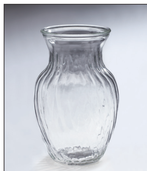
Vase 3" Neck-Your Choice