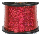
D31613 Red Holographic Ribbon