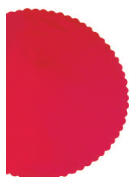
40213 Red Foil Circles