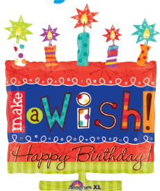
44436-26 1 ea-36" Foil Balloon