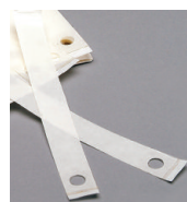
94291 2 ea-Adhesive Tabs