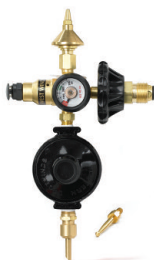
BR74HG Dual Foil + Latex Regulator