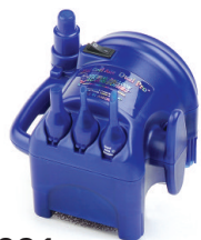
831 Mini Cool Aire® Dual Pro™ Inflator