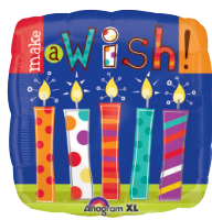
4443518 4 ea-18" Foil Balloons