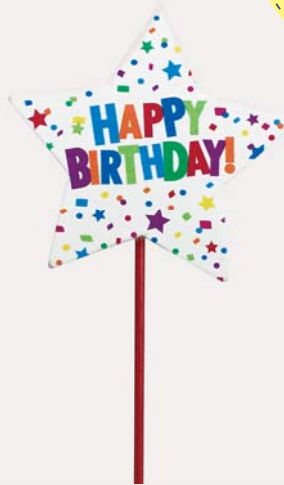
1985-144 Picks Wood. Clip. 12" Tall 3½"H × 3½"W $24.48 set/24. $1.02 ea Qty Ordered _____