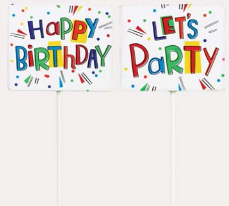
3020-144 Pick Asst. Wood. Clip. 12" Tall 2½"H × 3"W $24.48 set/24. $1.02 ea Qty Ordered _____

burton +BURTON the TOTAL gift experience®