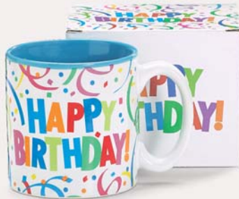
1985-00 Mugs Ceramic. 13 oz $21.72 set/6. $3.62 ea Qty Ordered _____