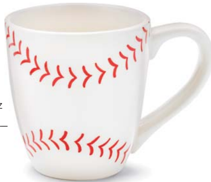
9722092 Mugs. 13 oz Qty Ordered _____