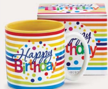
9726884 Mugs Ceramic. 13 oz $21.72 set/6. $3.62 ea Qty Ordered _____