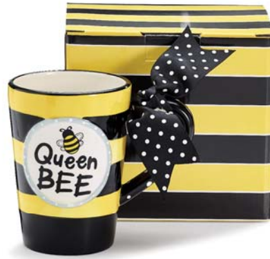
9719848 Mugs Hand-painted raised ceramic. 13 oz $33.12 set/4. $8.28 ea Qty Ordered _____