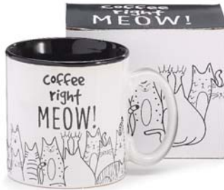
9731706 Mugs Ceramic. 13 oz $21.72 set/6. $3.62 ea Qty Ordered _____