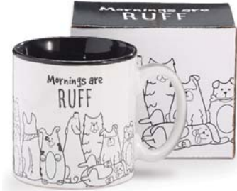
9731707 Mugs Ceramic. 13 oz $21.72 set/6. $3.62 ea Qty Ordered _____