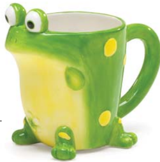
6643-75 Mugs Hand-painted raised ceramic. 10 oz $30.00 set/4. $7.50 ea Qty Ordered _____