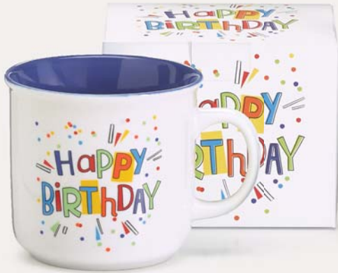
3020-155 Mugs Ceramic. 14 oz $22.32 set/6. $3.72 ea Qty Ordered _____