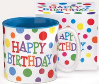
0611-00 Mugs Ceramic. 13 oz $21.72 set/6. $3.62 ea Qty Ordered _____