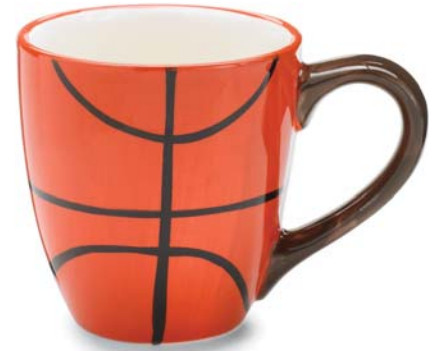
9722091 Mugs. 14 oz Qty Ordered _____