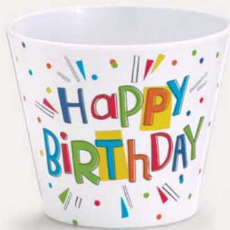
3020-303 #4 Pot Covers Melamine. Food safe. 4½"H × 5" Opening $15.48 set/12. $1.29 ea Qty Ordered _____