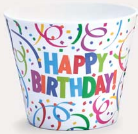
1985-303 #4 Pot Covers Melamine. Food safe. 4½" H x 5" Opening $15.48 set/12. $1.29 ea Qty Ordered _____