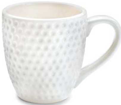
9722088 Mugs. Recessed. 15 oz Qty Ordered _____

Hand-painted ceramic. $31.02 set/6. $5.17 ea same design