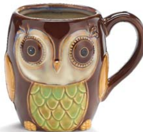
9719226 Mugs Hand-painted raised porcelain. 12 oz $21.72 set/6. $3.62 ea Qty Ordered _____