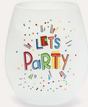
3020-313 Wine Glasses Handblown frosted glass. 16 oz • 4¼"H × 2¾" Opening $20.68 set/4. $5.17 ea Qty Ordered _____