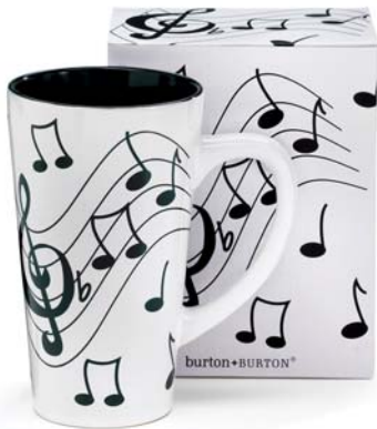
0792-87 Mugs Ceramic. 16 oz $20.68 set/4. $5.17 ea Qty Ordered _____