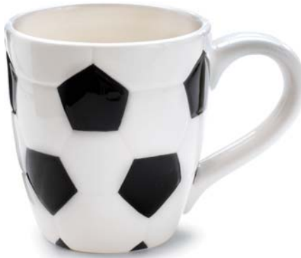
9722089 Mugs. Recessed. 13 oz Qty Ordered _____