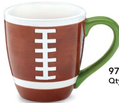
9722086 Mugs. 14 oz Qty Ordered _____