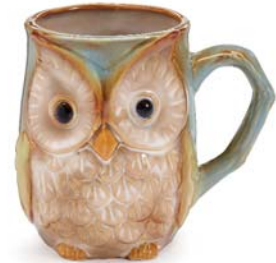
9730074 Mugs Hand-painted raised porcelain. 12 oz $24.78 set/6. $4.13 ea Qty Ordered _____