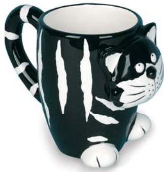
6546-75 Mugs Hand-painted raised ceramic. 14 oz $30.00 set/4. $7.50 ea Qty Ordered _____