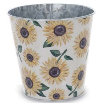
NEW 9748415 #4 Pot Covers Printed galvanized tin. PVC liners. 4¾"H × 4¾"Opening $28.56 set/12. $2.38 ea Qty Ordered