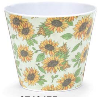
NEW 9748475 #4 Pot Covers Melamine. Food Safe. 4½"H × 5"Opening $15.48 set/12. $1.29 ea Qty Ordered