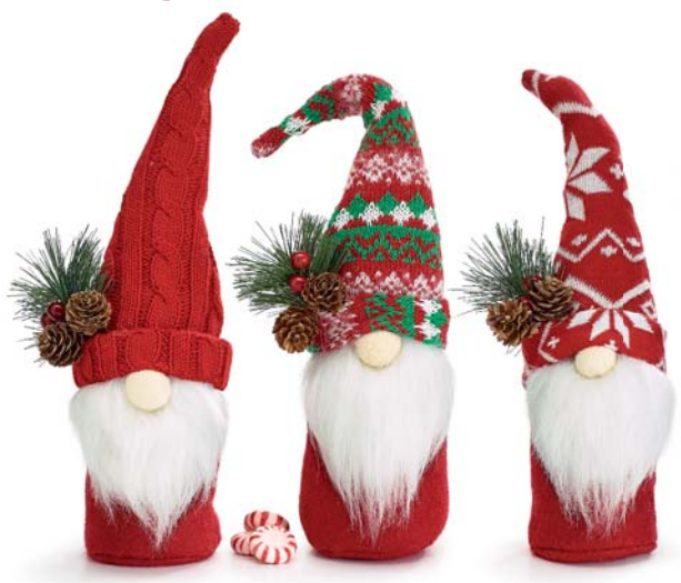
9741317 Shelf Sitter Asst. Fabric, faux fur fabric, felt, PVC, wood, and foam. 12"H × 3"Diameter