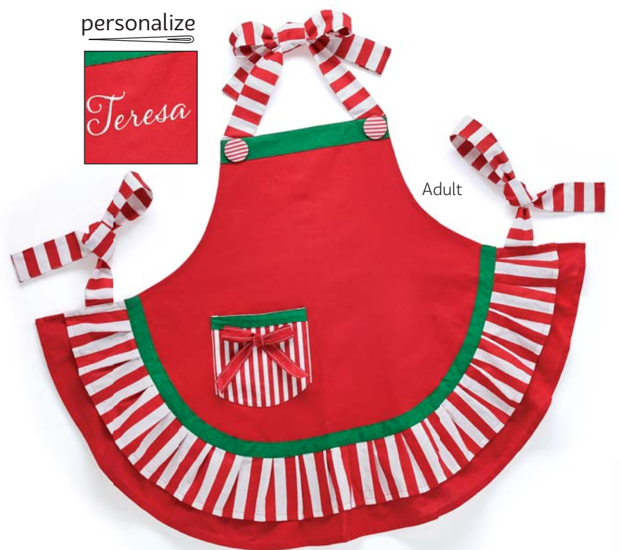
9745371 Aprons Adult. Fabric. One size fits most. 28½"H × 40"W

$31.06 set/2. $15.53 ea Qty Ordered _____