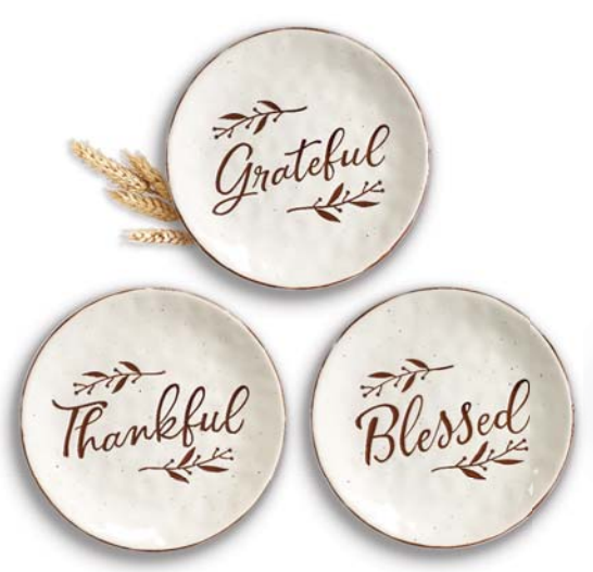
9745540 Plate Asst. Hand-painted recessed ceramic. 8" Diameter $43.50 set/6. $7.25 ea Qty Ordered