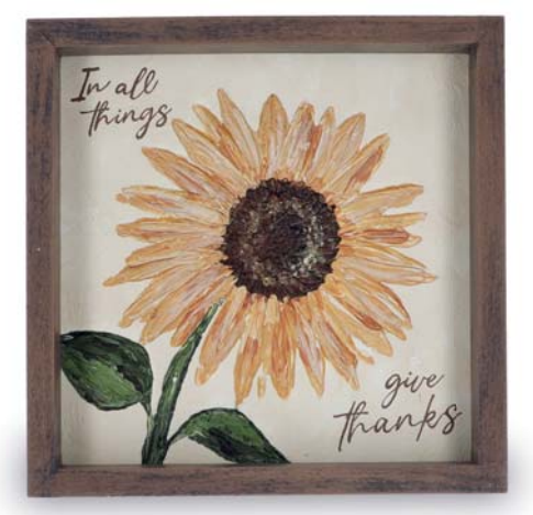
NEW 3113-249 Shelf Sitters Wood. Textured paint. 6"H × 6"W $37.20 set/6. $6.20 ea Qty Ordered _____