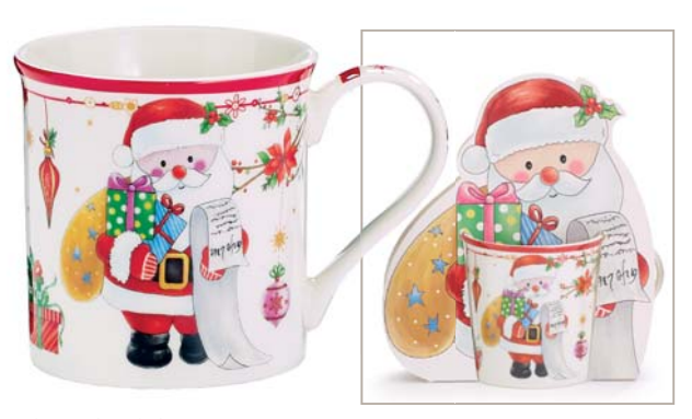
9740180 Mug + Caddy Gift Sets Bone china and heavy paperboard. 11 oz • 8"H × 6½"W × 3¼"D $24.78 6 sets. $4.13 set Qty Ordered ___