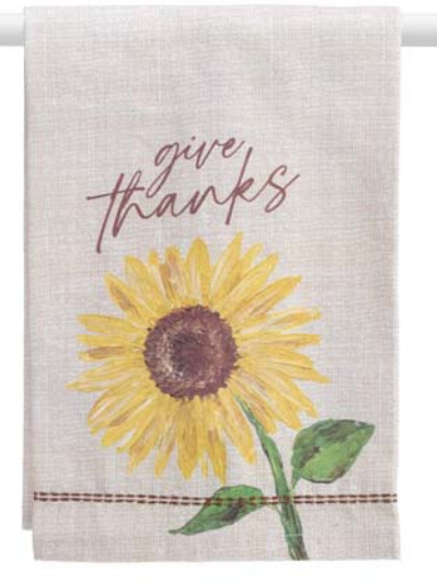
NEW 3113-310 Tea Towels Fabric. 13½"W × 22"L $31.02 set/6. $5.17 ea Qty Ordered _____