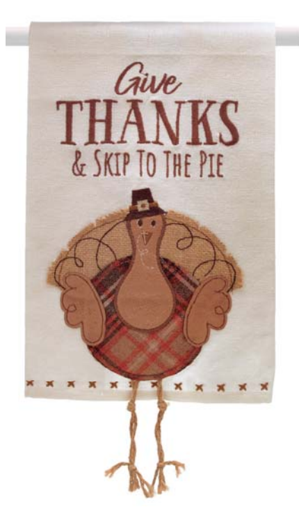
9745385 Tea Towels Fabric. 12"W × 22"L $21.72 set/6. $3.62 ea Qty Ordered