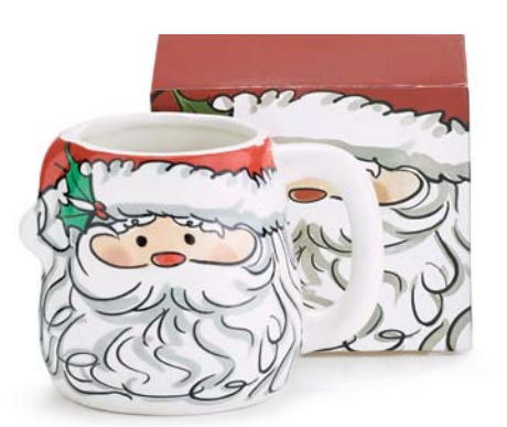
2088-38 Mugs Raised ceramic. 16 oz $34.08 set/6. $5.68 ea. Qty Ordered