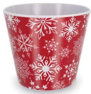
NEW 9748473 #4 Melamine. Food safe. 4½"H × 5"Opening $15.48 set/12. $1.29 ea Qty Ordered _