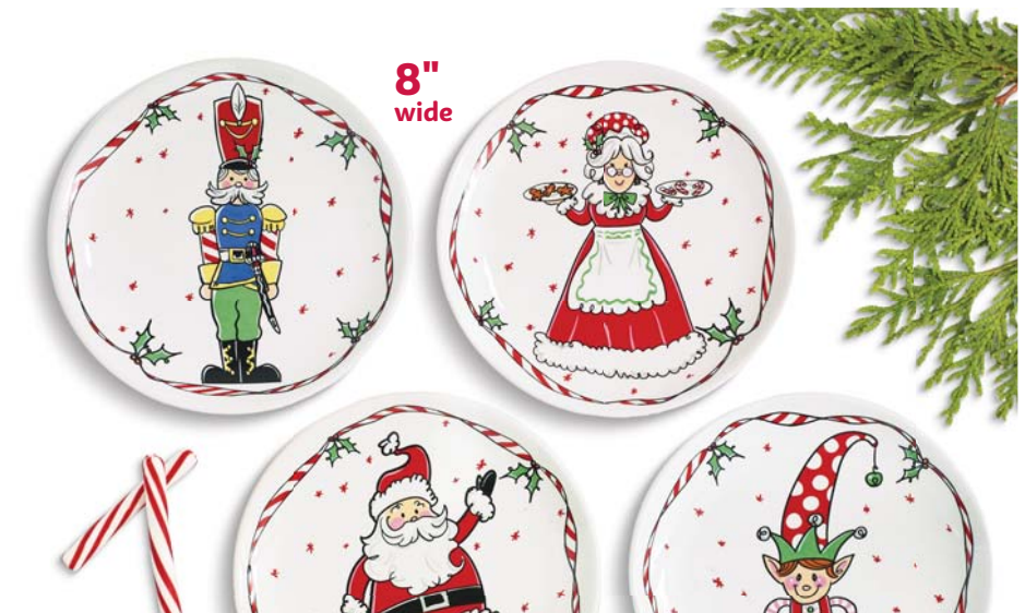
3078-97 Plate Asst. Ceramic. 8" Diameter $49.68 set/8. $6.21 ea Qty Ordered