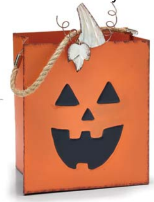
9745292 Planter Asst.

Hand-painted embossed tin, galvanized embossed tin, and rope. PVC liners. 10"H \times 111/2"W \times 41/2"D 101/2"H \times 71/2"W \times 41/2"D • Opening: 53/4"W \times 5"D