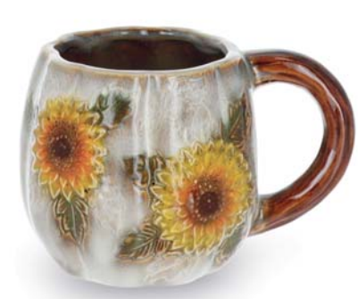
NEW 9748775 Mugs Hand-painted raised porcelain. 16 oz $31.02 set/6. $5.17 ea Qty Ordered _____