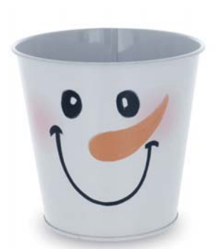
NEW 9748461 #4 Printed tin. 4¾"H × 4¾"Opening $28.56 set/12. $2.38 ea Qty Ordered _____