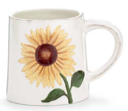
NEW 3113-75 Mugs Hand-painted raised ceramic. 18 oz $34.08 set/6. $5.68 ea Qty Ordered ___