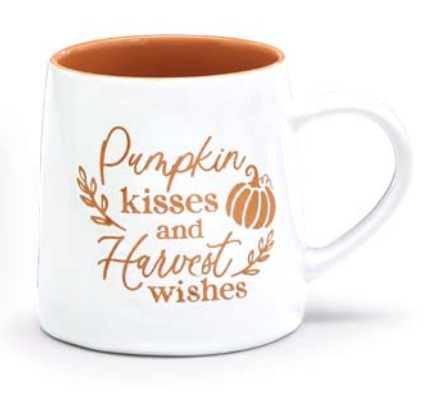
NEW 9748604 Mugs Recessed ceramic. 16 oz $46.68 set/12. $3.89 ea Qty Ordered _____