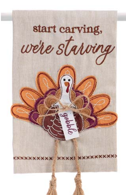
NEW 9748605 Tea Towel Asst. Fabric. 12"W × 22"L $31.02 set/6. $5.17 ea Oty Ordered