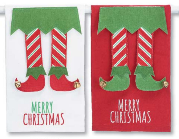
9742476 Elf Boot Tea Towel Asst. Fabric and embossed tin. 13\frac{1}{2} "W × 22"L $31.08 set/6. $5.18 ea Qty Ordered _

$31.06 set/2. $15.53 ea Qty Ordered _____