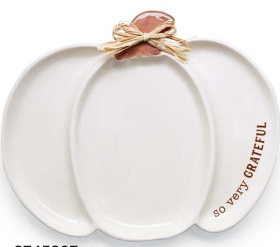
9745387 Plates Hand-painted raised ceramic and raffia. 14" Wide $31.06 set/2. $15.53 ea Qty Ordered _____